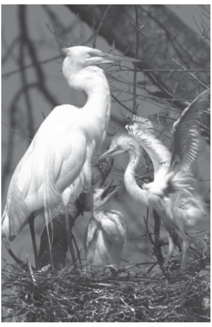
Great\ Egret\ with\ young.

with the 7th edition (1998) A.O.U. checklist and the 45<sup>th</sup> Supplement (July 2004). Eighty-five species have been documented as nesting on the refuge.