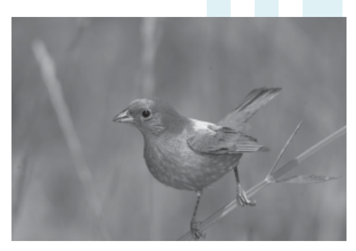
\begin{array}{l} Painted\ Bunting. \\ \text{} \end{array}